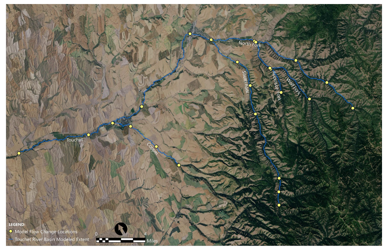
Figure C-2 Touchet Basin Hydrologic Calculation Points

An error in the StreamStats database provided a challenge for computing the hydrology at junctions within the model. Running flood discharge computations in StreamStats immediately above the junctions and manually summing the values significantly overestimated running StreamStats immediately below the same confluence (USGS 2019a). To avoid having a large amount of flow erroneously created at each confluence, a StreamStats calculation was made downstream of each junction and upstream of the junction on the smaller of the two tributaries, but not upstream of the junction on the larger tributary. This method ensured flood discharges increased from upstream to downstream throughout the basin while obeying conservation of flow at the junctions.